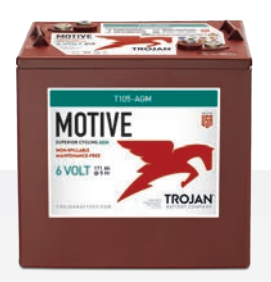
MOTIVE 6-VOLT-AGM KEY FEATURES