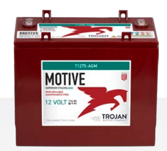
MOTIVE 12-VOLT AGM

C-Max Technology Proprietary Paste Premium Separator