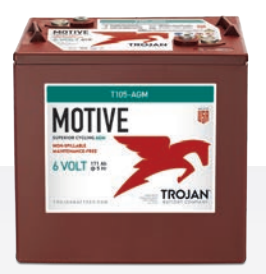
MOTIVE 6-VOLT AGM