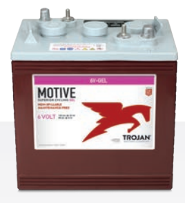
MOTIVE 6-VOLT GEL