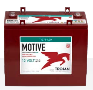
MOTIVE 12-VOLT AGM