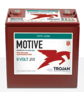
MOTIVE 8-VOLT AGM

C-Max Technology Proprietary Paste Premium Separator