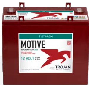
MOTIVE 12-VOLT AGM