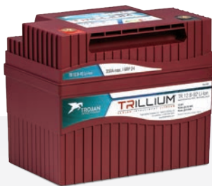
TR 12.8-92 LI-ION

Delivers more runtime and longer life than other batteries in its class and delivers consistent power across the state of charge range. It's 20% smaller than competitors' batteries, can be charged in less than two hours, and is scalable up to 48 volts.