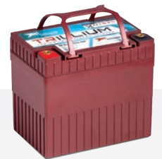
TR 25.6-25 LI-ION

Microprocessor Amp-Hour Life Tracking SOC Gauge Battery Management System Cell Balancing